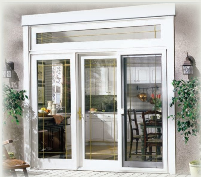
2 Panel and 3 Panel Traditional and French Sliding